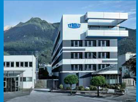
Tyrolit headquarters in Schwaz (Austria)

Headquartered in Schwaz (Austria), the family-owned business combines the strengths of being a part of the dynamic Swarovski Group with a century's worth of individual corporate and technological experience.