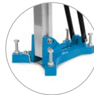
Compact dowel foot